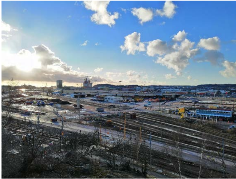
Figure 1: Project area Gullbergsvass district in Göteborg, Sweden (Source: Authors' photo).

The area for design was located in Sweden, in Gothenburg, in the Gullbergsvass district, which is a strategic area for a city development (see Figure 1).