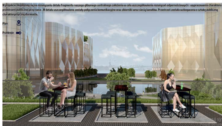
Figure 4: Detailed design of public space (Source: project by Agata Kielecka, Nadia Kocaba, Paulina Kummer and Adrianna Dębowska).

During the course, the students worked in groups with 3D models that allowed them from the start to work with the third dimension of the city structure (see Figure 5). They constructed one large model of the existing neighborhood and individual models for their concepts.